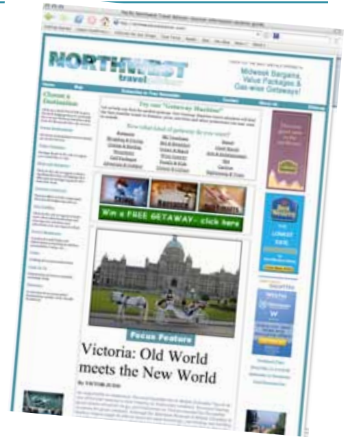
Getaway Media Corp's Northwest Travel Advisor website